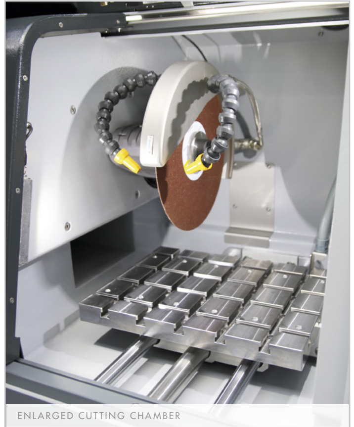
ENLARGED CUTTING CHAMBER

The switch to smart touch screen controls allows intuitive operation and now offers all the functions of our program-based large room cutting machines, such as the MPP (Multi-Position Process). Different components can be positioned simultaneously and added in an automatic cutting process.